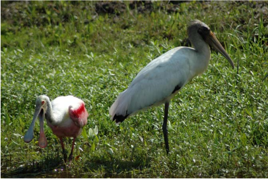
Roseate Spoonbill (left) and Woodstork