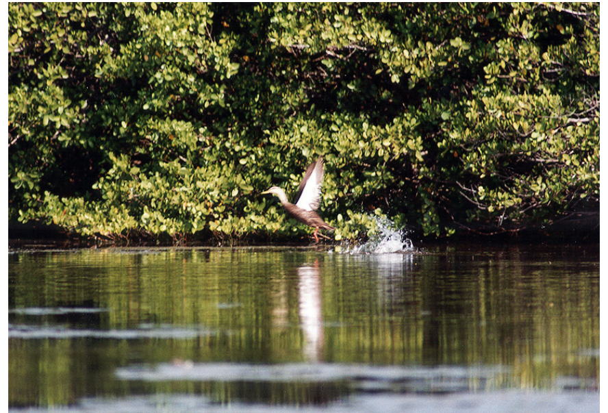
Mottled Duck taking to flight