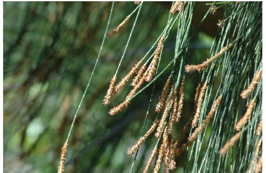
Close-up of Australian Pine "needles"