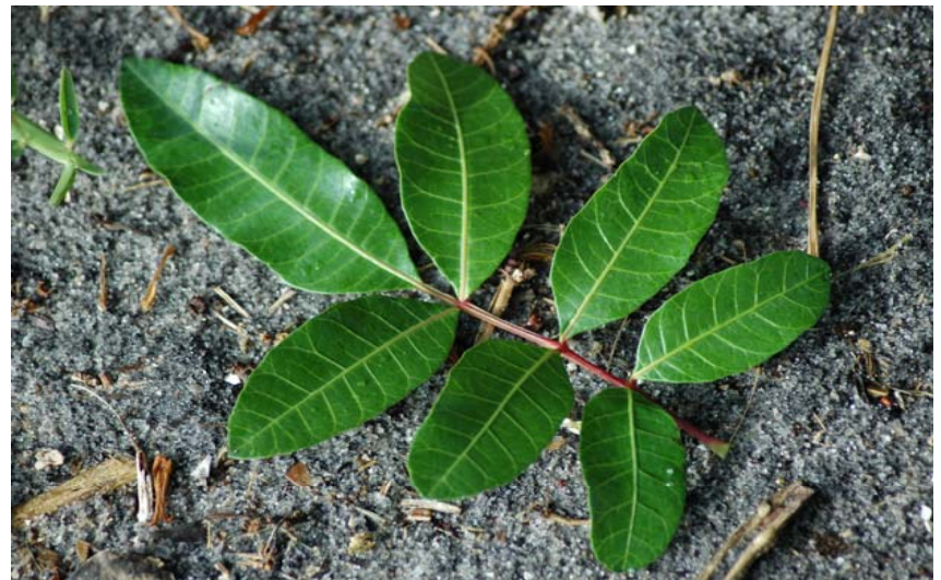
Close-up of Brazilian Pepper leaf