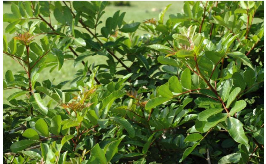
Brazilian Pepper (invasive non-native)

Reflect on your Kayaking adventure, using all of your senses to describe your experience.