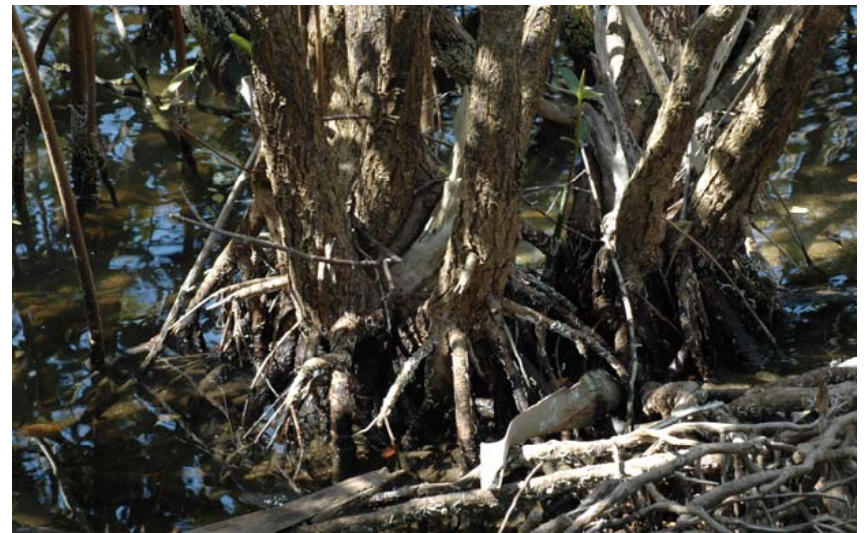
Aerial Roots at base of White Mangrove