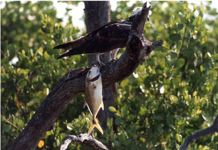
Osprey with fish (jack)