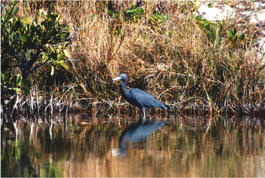
Little Blue Heron