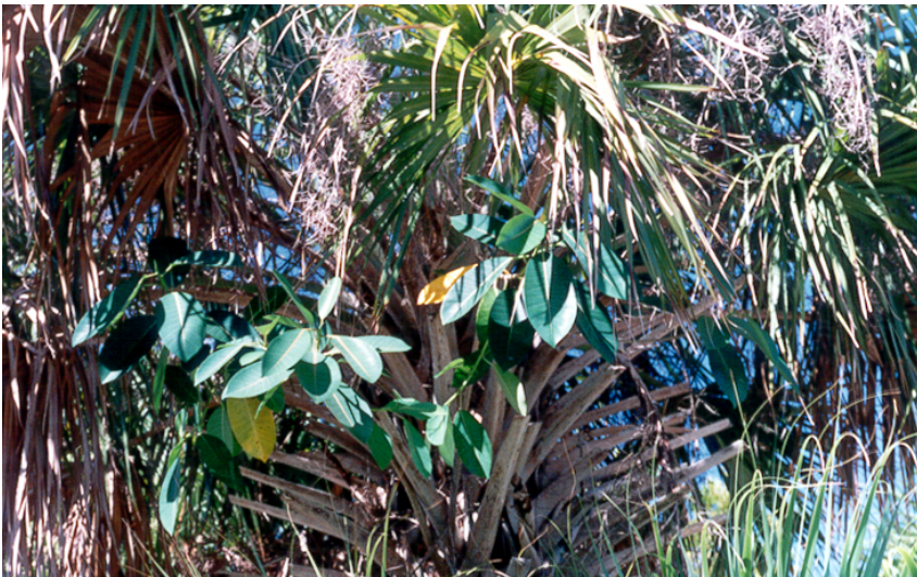
Strangler Fig (growing in Sabal Palm)