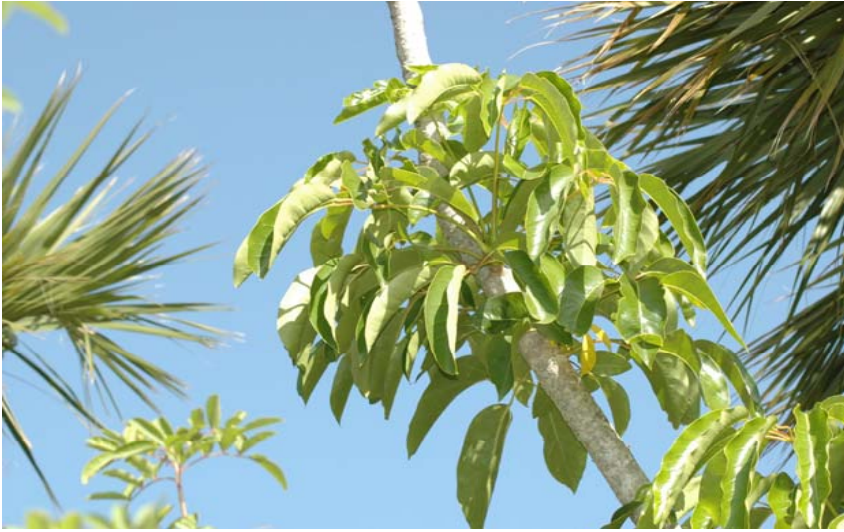
Schefflera (moderately invasive non-native)