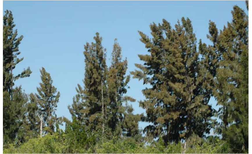
Australian Pine (invasive non-native)