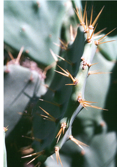
Prickly Pear Cactus

Mission Accomplished!!! Head north east, follow the trail back to the Florida privet bush.